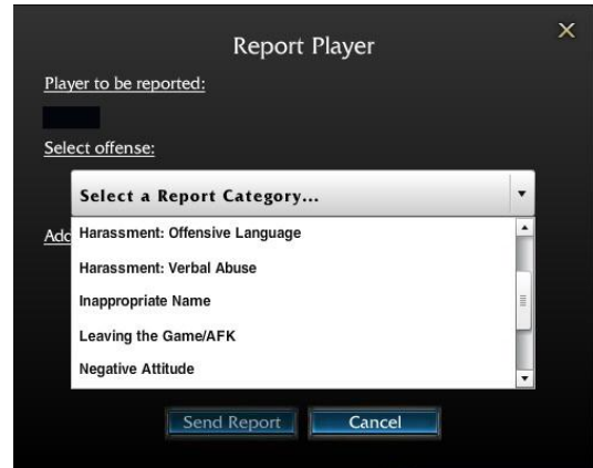
Figure 1. Report Disruptive Behavior.

of disruptive behavior she wants to report from a list created by Riot Games (see Figure 1). The Tribunal automatically collects reports and game logs and organizes them into Tribunal cases. A Tribunal case consists of reports from multiple players.