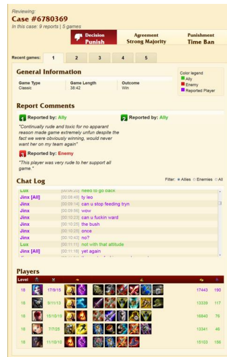
Figure 2. A Tribunal Case.

The Tribunal system automatically collects reports and game logs and organizes them into Tribunal cases. Game logs include in-game information such as game length, game type, types of disruptive behavior, and chat log (see Figure 2)